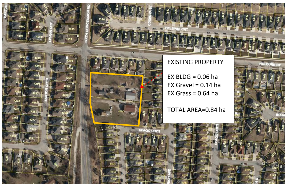
Figure 1: Existing Conditions

As shown in Figure 1, the existing site consists of a gravel parking lot with catch basins. The soil maps provided by ERCA suggest that the soil in the site area is Brookston Clay Loam.