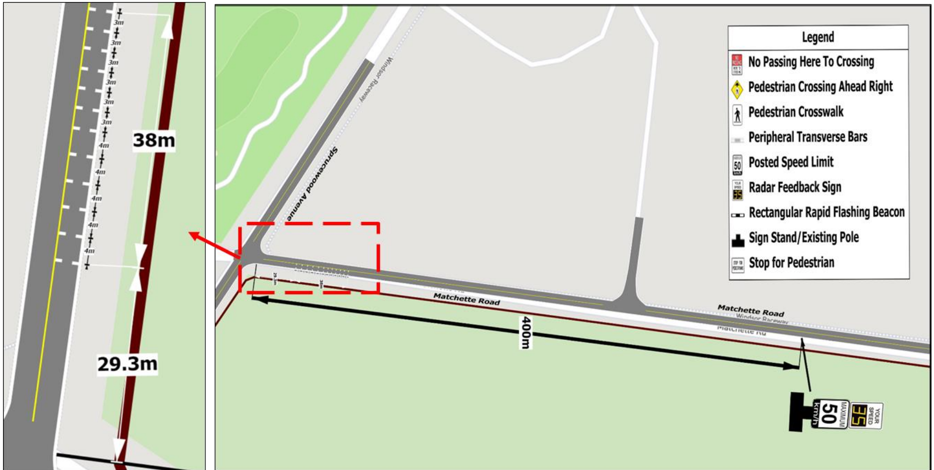
Figure 2. Matchette Road at Sprucewood Avenue