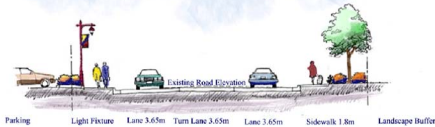
Section C - 'C' North Precinct- Walker Road @ Ontario Rd.