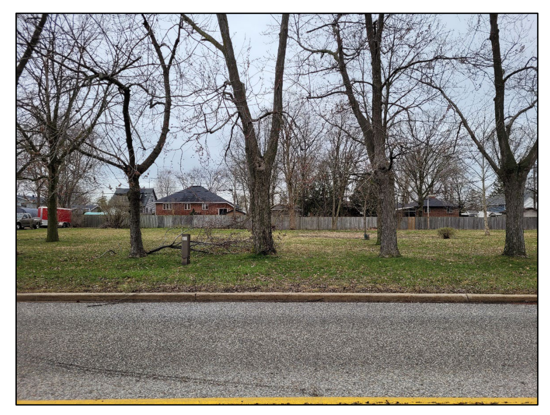
Figure 1b – Site Street View

The Site is currently vacant (see Figure 1b – Site Street View).