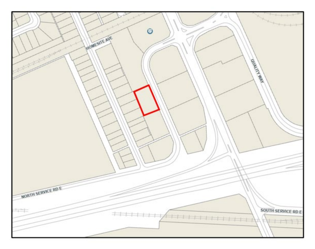
Figure 1a – Site Location

The Site is made up of one (1) rectangular-shaped interior parcel of land located on the west side of North Service Road East, which abuts the north limit of 6010 North Service Road East (see the area in red on Figure 1a – Site Location).