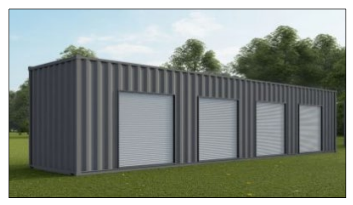
Figure 2b – Sample Elevation

A sample elevation has been prepared (see Figure 2b – Sample Elevation).