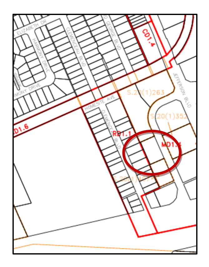
Figure 4 –ZBL

The zoning for the Site is proposed to be changed to a site specific Manufacturing District 1.4 (MD1.4 - S.20(1)(XXX)) category as shown on Map 11 of the City of Windsor Zoning By-Law (ZBL) in order to permit a self-storage facility as an additional permitted use.