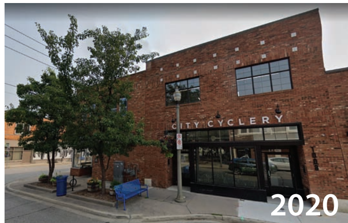
Past vs. present 1009 Drouillard Rd.