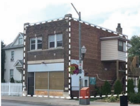
Example of one (1) eligible storefront facade, plus one visible side facade

Note* More than one category can be selected based on work being proposed.