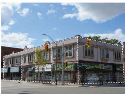
Example of four (4) eligible storefront facades, plus one visible side facade