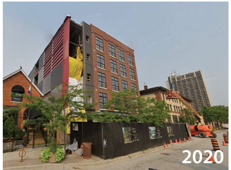
Past vs. present 531 Pelissier St.

Example of a project where the applicant took advantage of all grants available through the Main Street CIP including improvements to the existing facade, interior space, and new residential units above the vacant storefronts.