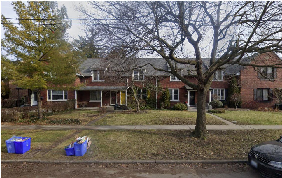
Fig. 2 – A common sight – recycle bins stored on front porches