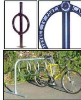
Examples of Post & Ring and Multi Unit Bike Racks

The bike rack must be consistent with the intended character/theme of the district and other streetscape elements.