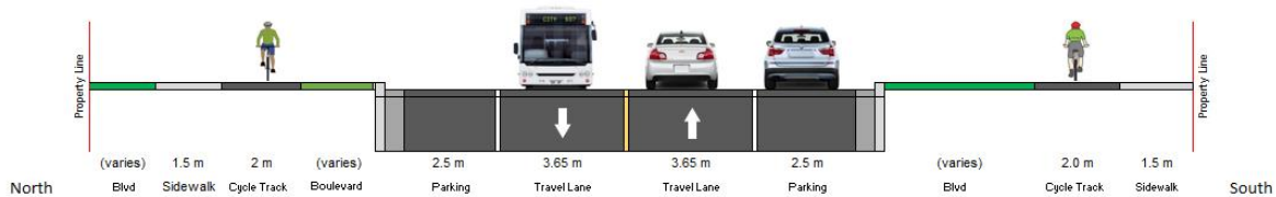
Modified Cross Section – as per comments provided by City

The requested change to the location of the cycle tracks behind the boulevard requires the following activities: