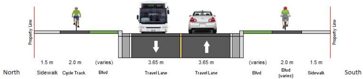
Modified Cross Section – as per comments provided by City

The requested change to the location of the cycle tracks behind the boulevard requires the following activities: