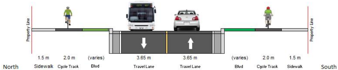
Modified Cross Section – as per comments provided by City

The requested change to the location of the cycle tracks behind the boulevard requires the following activities: