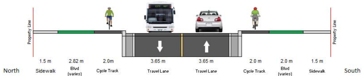
Typical Cross Section - as per Design Plates (August 2020)