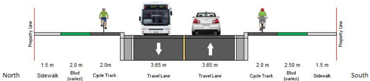
Typical Cross Section - as per Design Plates (August 2020)