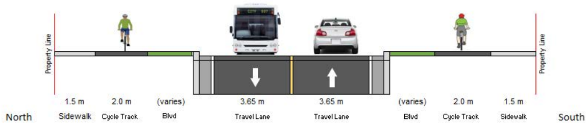
Modified Cross Section – as per comments provided by City

The requested change to the location of the cycle tracks behind the boulevard requires the following activities: