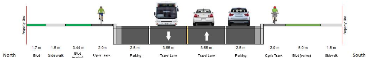
Typical Cross Section - as per Design Plates (August 2020)