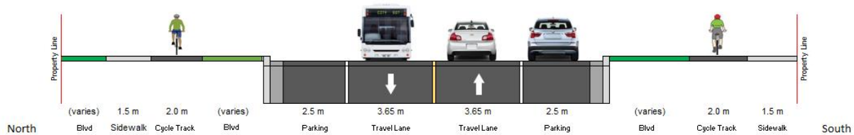
Modified Cross Section – as per comments provided by City

The requested change to the location of the cycle tracks behind the boulevard requires the following activities: