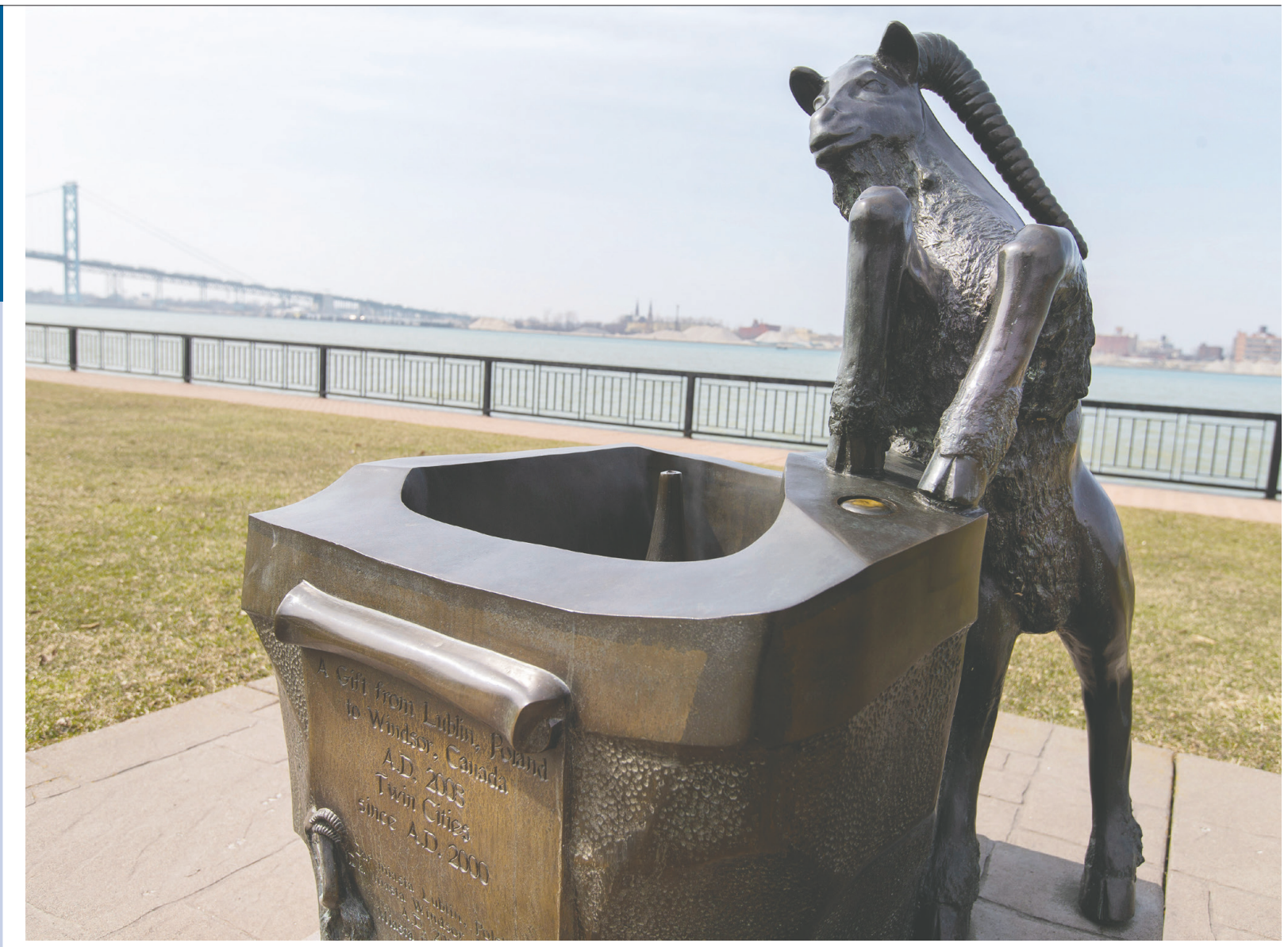
Billy Goat Spring was a gift from Lubin, Poland, to Windsor in 2008 and sits in Centennial Park. The cities twinned in 2000. Lubin is located fewer than 100 kilometres from Poland's border with Ukraine and is the first point of contact for many refugees escaping the war with Russia.

In an April 5 story on A1 of the Windsor Star, "New transmission line projects announced for Southwestern Ontario," a Hydro One spokesperson misstated the date when the first of the announced transmission lines will be operational. The Chatham to Lakeshore Line is expected to be in service by the end of 2025, not 2024 as stated by the spokesperson.