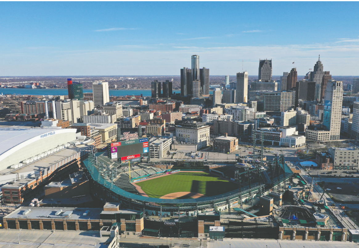
Tailgaters will set up around downtown Detroit and Comerica Park early Friday.

If you're going, it's probably a good idea to bundle up and bring an umbrella. Environment Canada is forecasting 10C on Friday with a 60 per cent of rain. And you'll have to find your own transportation.