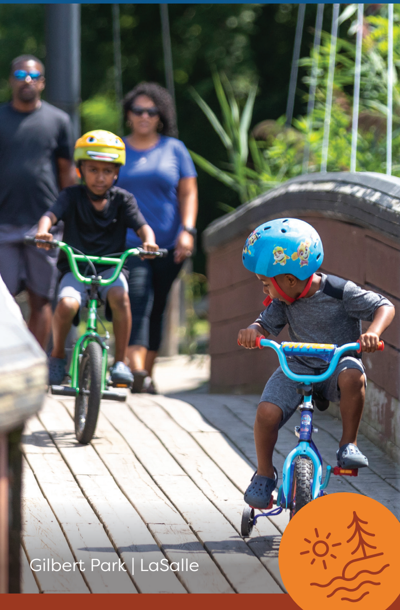
Gilbert Park | LaSalle