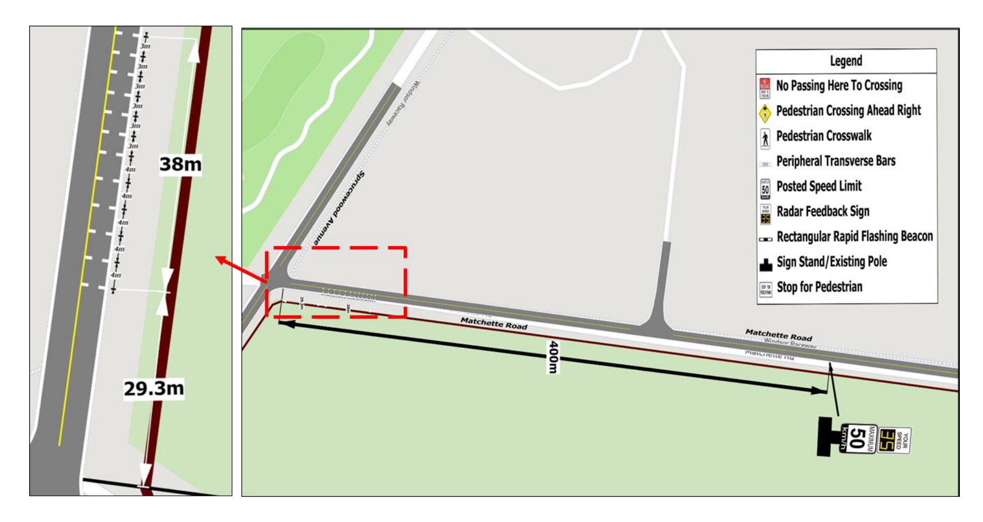
Figure 2. Matchette Road at Sprucewood Avenue