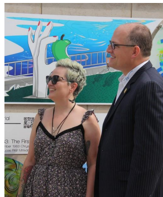
Artist unveiling the work