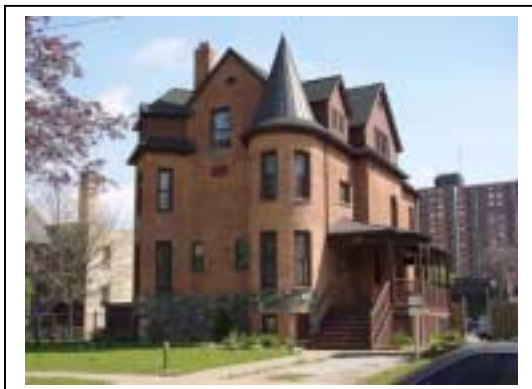
694 The Abner F. Nash house (1895)

Another version of Queen Anne Revival has undergone extensive renovation, but its dominant gable and angled two-storey bay help to identify its architectural heritage. Bauer was a member of City Council in 1892, and purchased the building lot from the Windsor Building and Land Co. The current owner has stated that, in 1902, the house was moved to this site from land owned by the Detroit-Windsor Tunnel Corporation. It is also referred to as "the Churchill house," after later owners.