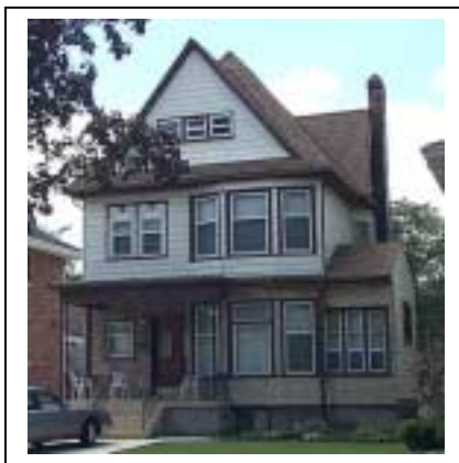
685 The Ernest Bauer house (c. 1895)

Justice Sutherland (see #345) owned two houses of differing style before the turn of the century. The city directory of 1899 lists him as tenant. He bought the land from the Windsor Land and Building Company for $1,050 and assumed a mortgage for $4,500 to build this clapboard house. The multi-paned windows are a Queen Anne Revival characteristic.