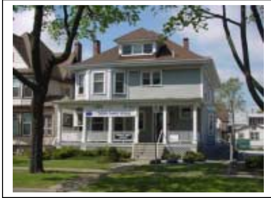
677 The Hon. R. F. Sutherland house (1899)

Justice Sutherland (see #345) owned two houses of differing style before the turn of the century. The city directory of 1899 lists him as tenant. He bought the land from the Windsor Land and Building Company for $1,050 and assumed a mortgage for $4,500 to build this clapboard house. The multi-paned windows are a Queen Anne Revival characteristic.